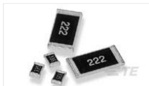
TE Part #1-1879496-9 CRGH0805 5% 68K 0.33W