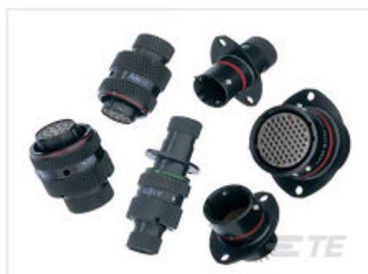
TE Part #AS908 CAP PROT. TYPE 9. #08