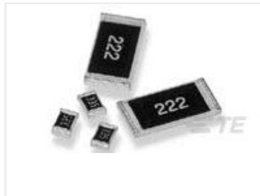
TE Part #1-1879496-3 CRGH0805 5% 39K 0.33W