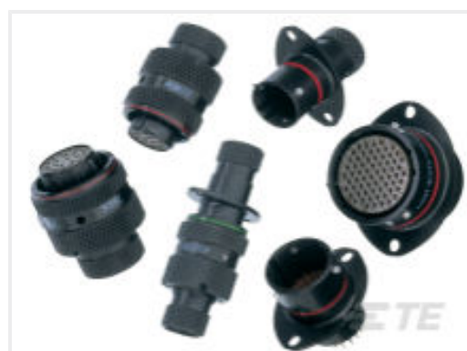
TE Part #AS618-35PN PLUG BOOT TERMIN'N TYPE 6