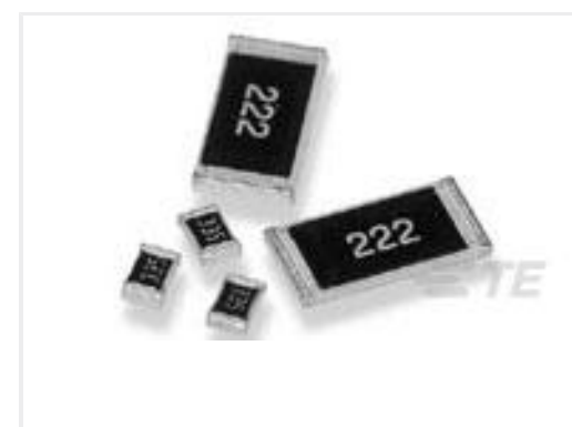
TE Part #2-1879496-9 CRGH0805 5% 180K 0.33W