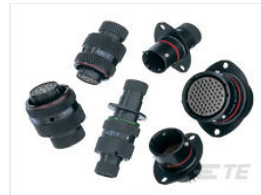
TE Part #AS014-97PN RECEPT.2 HOLE MNT.TYPE 0