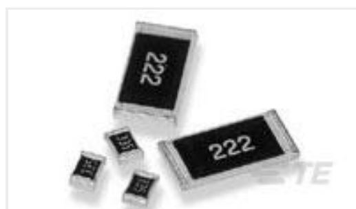
TE Part #1879511-9 CRGH0805 1% 15K 0.33W