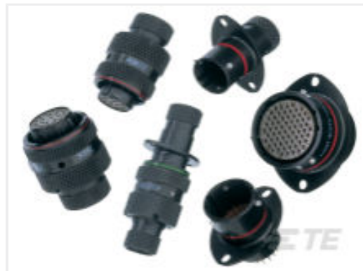
TE Part #AS612-35PN PLUG BOOT TERMINN TYPE 6