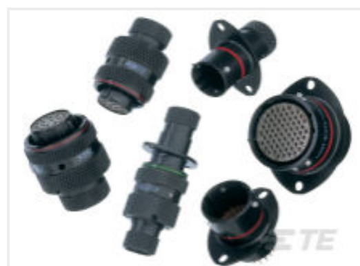
TE Part #AS614-35SN PLUG BOOT TERMIN'N TYPE 6