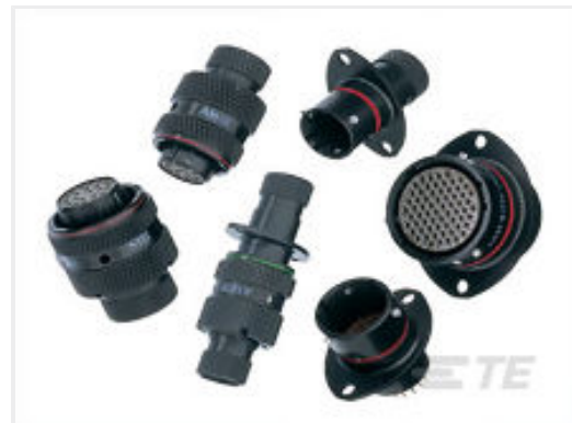
TE Part #AS616-35SN PLUG BOOT TERMIN'N TYPE 6