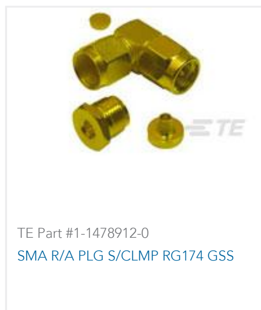
TE Part #1-1478912-0 SMA R/A PLG S/CLMP RG174 GSS