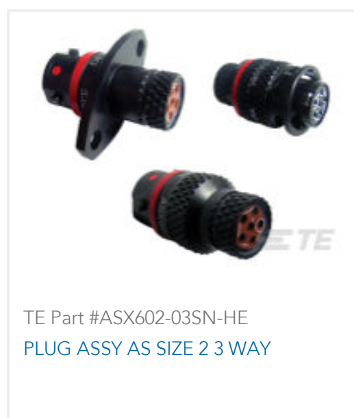
TE Part #ASX602-03SN-HE PLUG ASSY AS SIZE 2 3 WAY