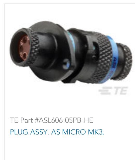
TE Part #ASL606-05PB-HE PLUG ASSY. AS MICRO MK3.