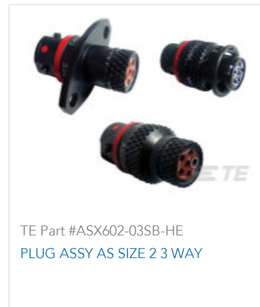
TE Part #ASX602-03SB-HE PLUG ASSY AS SIZE 2 3 WAY