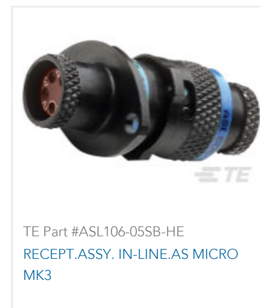
TE Part #ASL106-05SB-HE RECEPT. ASSY. IN-LINE. AS MICRO MK3