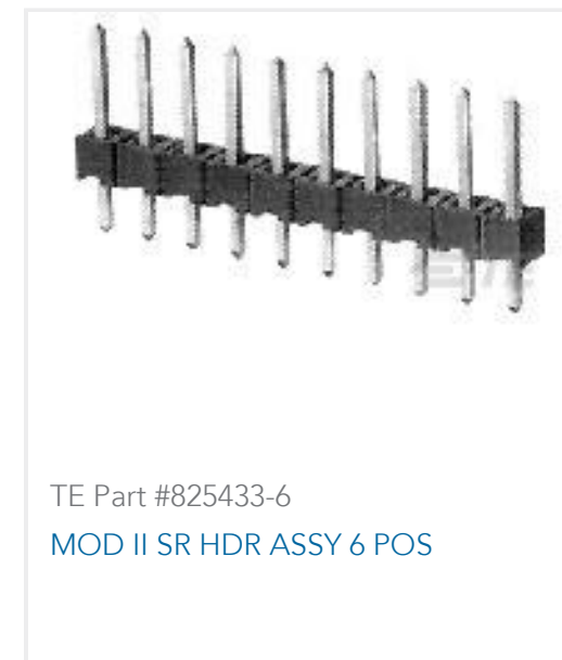
TE Part #825433-6 MOD II SR HDR ASSY 6 POS