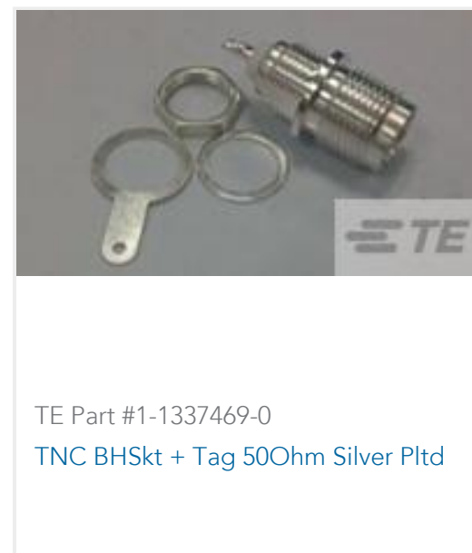
TE Part #1-1337469-0 TNC BHSkt + Tag 50Ohm Silver Pltd