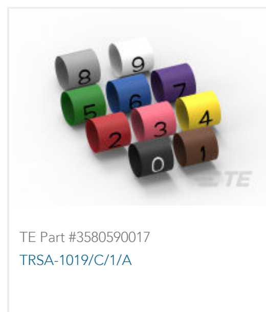
TE Part #3580590017 TRSA-1019/C/1/A