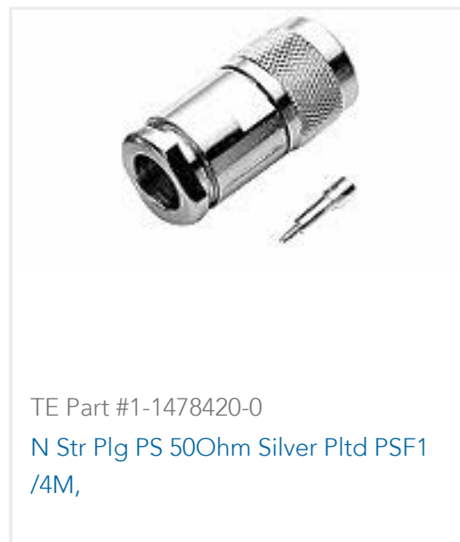
TE Part #1-1478420-0 N Str Plg PS 50Ohm Silver Pltd PSF1 /4M,