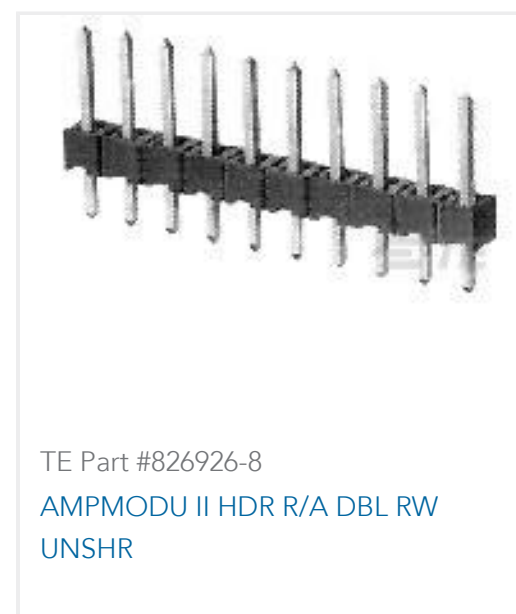
TE Part #826926-8 AMPMODU II HDR R/A DBL RW UNSHR