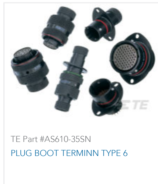
TE Part #AS610-35SN PLUG BOOT TERMINN TYPE 6