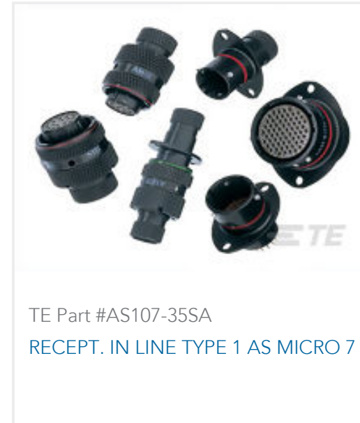
TE Part #AS107-35SA RECEPT. IN LINE TYPE 1 AS MICRO 7