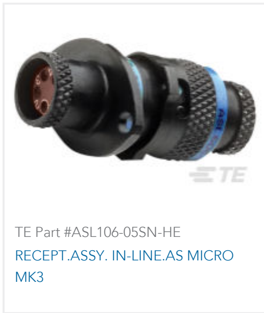
TE Part #ASL106-05SN-HE RECEPT.ASSY. IN-LINE.AS MICRO MK3