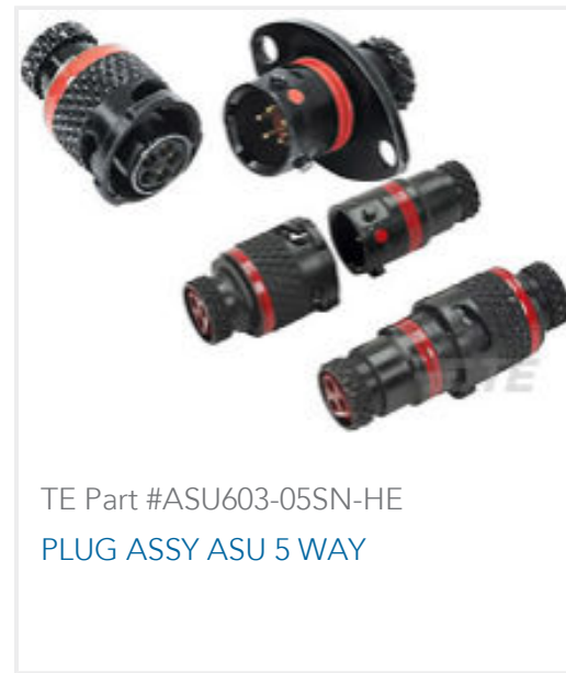
TE Part #ASU603-05SN-HE PLUG ASSY ASU 5 WAY