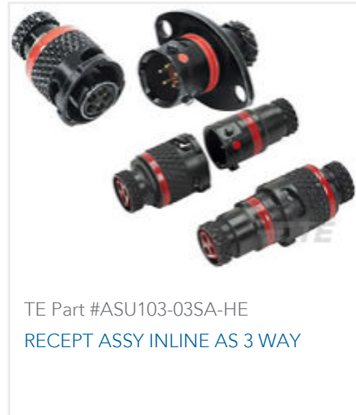
TE Part #ASU103-03SA-HE RECEPT ASSY INLINE AS 3 WAY