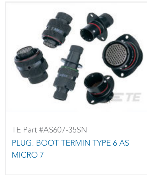
TE Part #AS607-35SN PLUG. BOOT TERMIN TYPE 6 AS MICRO 7