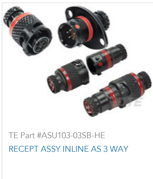
TE Part #ASU103-03SB-HE RECEPT ASSY INLINE AS 3 WAY