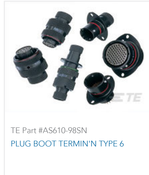
TE Part #AS610-98SN PLUG BOOT TERMIN'N TYPE 6