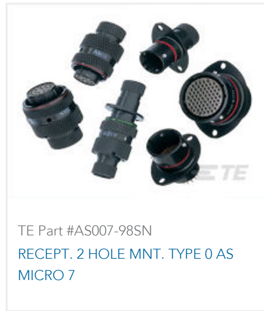
TE Part #AS007-98SN RECEPT. 2 HOLE MNT. TYPE 0 AS MICRO 7