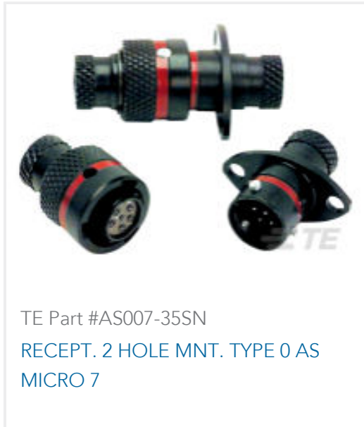
TE Part #AS007-35SN RECEPT. 2 HOLE MNT. TYPE 0 AS MICRO 7