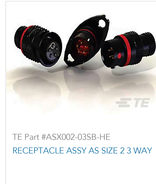
TE Part #ASX002-03SB-HE RECEPTACLE ASSY AS SIZE 2 3 WAY