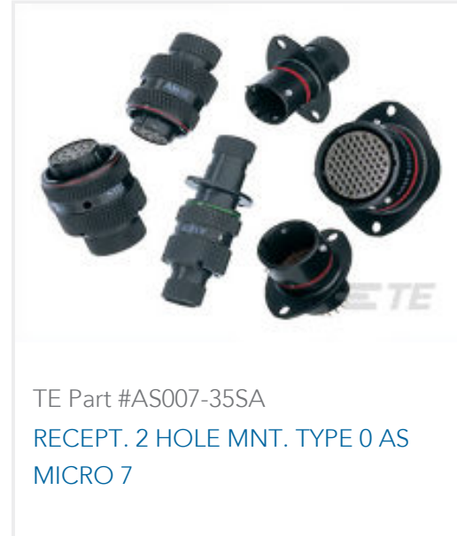
TE Part #AS007-35SA RECEPT. 2 HOLE MNT. TYPE 0 AS MICRO 7