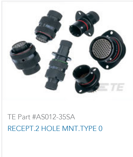
TE Part #AS012-35SA RECEPT.2 HOLE MNT.TYPE 0