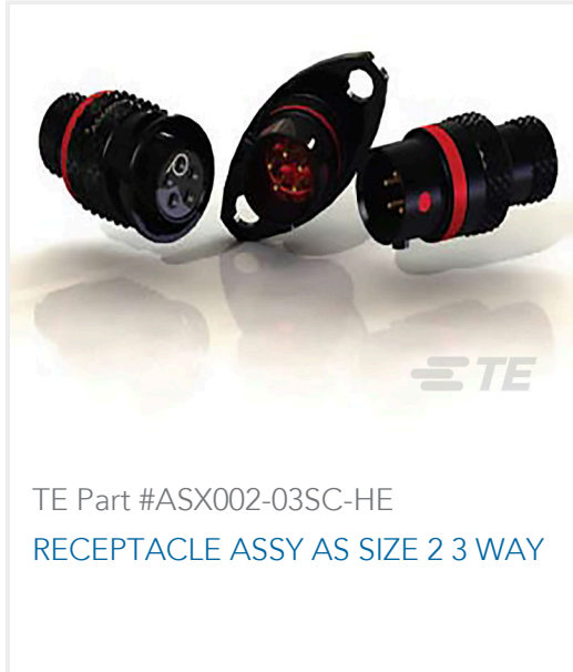
TE Part #ASX002-03SC-HE RECEPTACLE ASSY AS SIZE 2 3 WAY