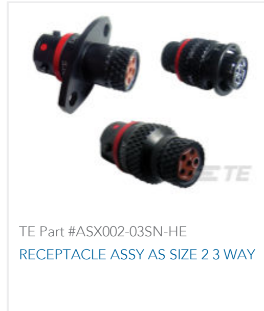
TE Part #ASX002-03SN-HE RECEPTACLE ASSY AS SIZE 2 3 WAY