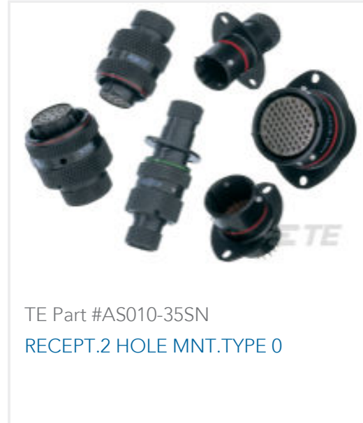
TE Part #AS010-35SN RECEPT.2 HOLE MNT.TYPE 0