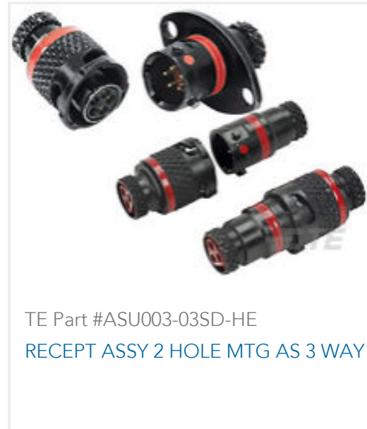
TE Part #ASU003-03SD-HE RECEPT ASSY 2 HOLE MTG AS 3 WAY