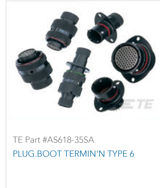
TE Part #AS618-35SA PLUG BOOT TERMIN'N TYPE 6