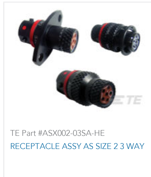
TE Part #ASX002-03SA-HE RECEPTACLE ASSY AS SIZE 2 3 WAY