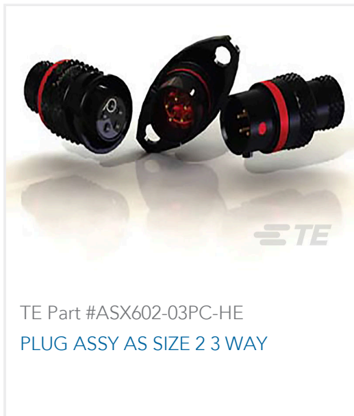
TE Part #ASX602-03PC-HE PLUG ASSY AS SIZE 2 3 WAY